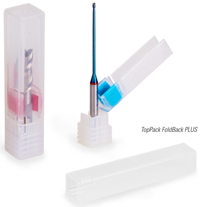
TopPack FoldBack PLUS